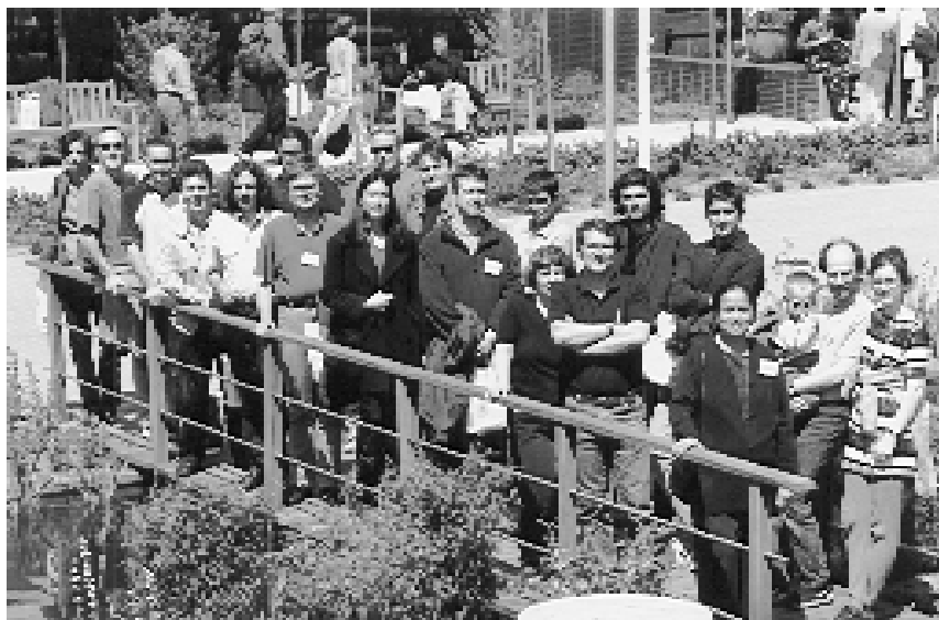
Recipients of 1999 CSA Trust Bursaries at the 5th International Conference on Chemical Structures in Noordwijkerhout, Netherlands

ever. In return, it is simply asked that the winners should supply a report within a year of the award, giving some detail of how the money was spent, in what way the conference was useful, etc.